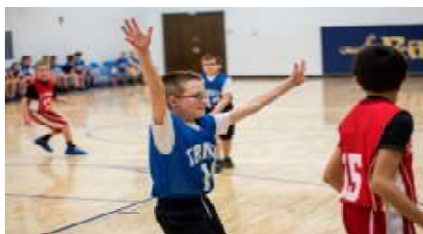
MLC basketball tournament fun on February 25 & 26, 2017