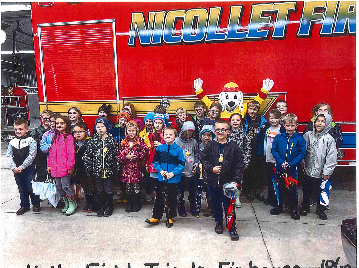
K-4 Field Trip to Firehouse 10/13