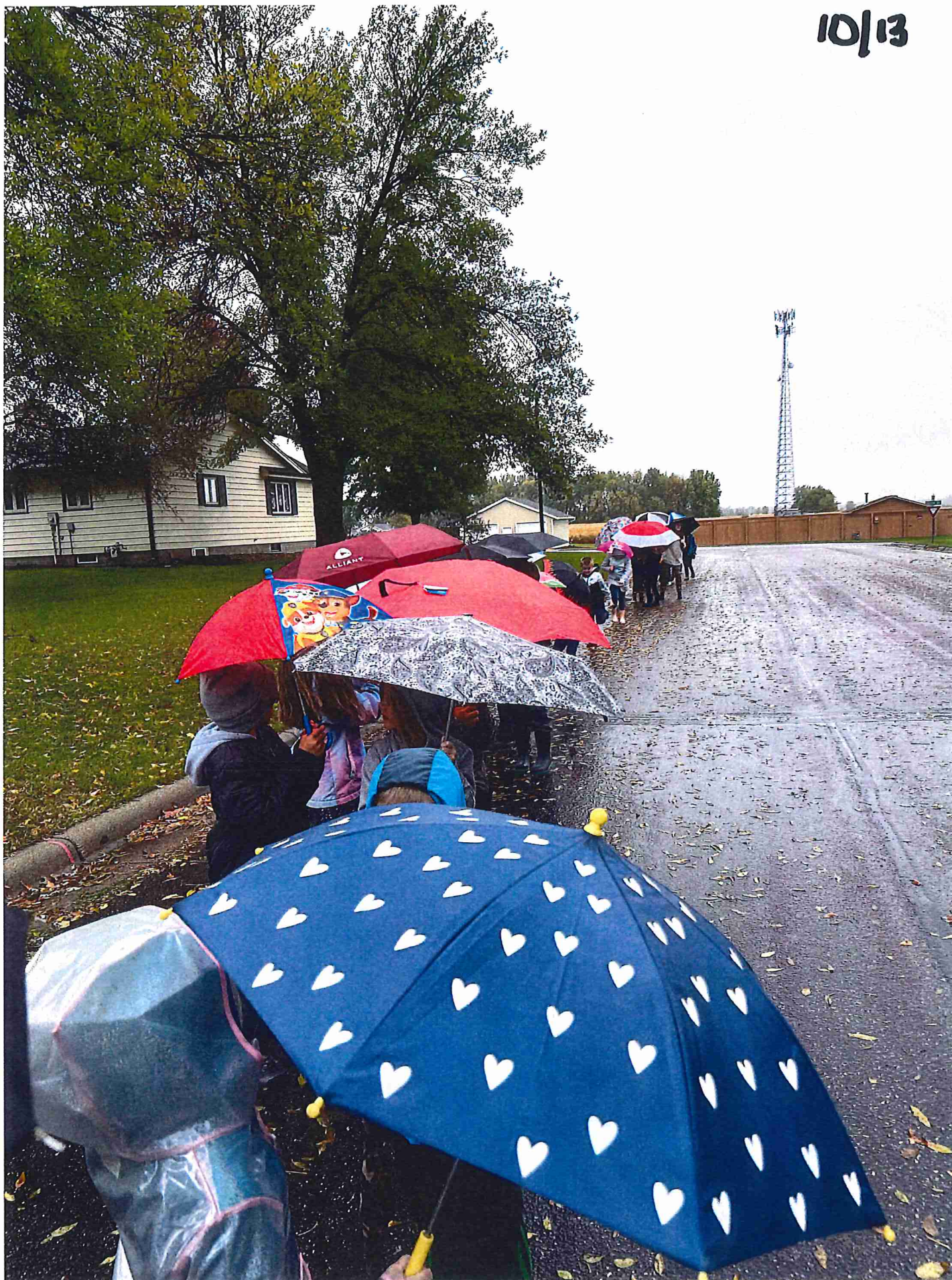
A Rainy Walk to the Firehouse!