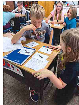
Working together to analyze fossils, dinosaur teeth and bones