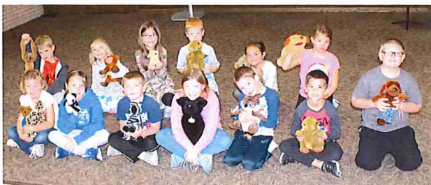
Our new Reading Buddies for Second Quarter!

to listen to children read — Awesome experience!