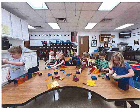
Exploring ramps and magnets.

Keep reading and record the books you have read to your child on the orange calendar. A calendar for the month of February will be going home this week. On February 9th there will be no bussing and no hot lunch .