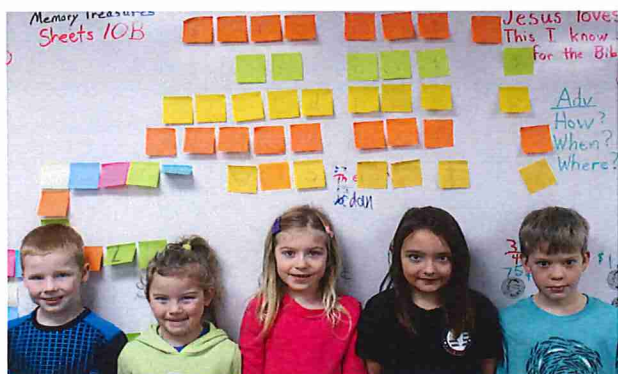
Using POST-Its to make contractions