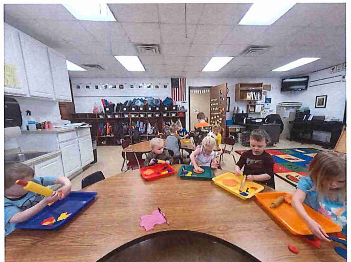
We identified shapes while making shape pizza.