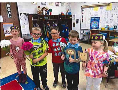
The Wedding of Q and U

May 23rd: Last day of school... Graduation in the evening.