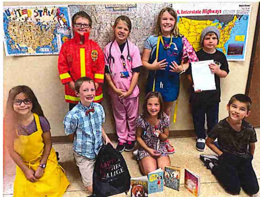
Career day: 3rd grade Class color day

Social Studies: We will be learning about rural communities and finish making our books about the three kinds of communities.