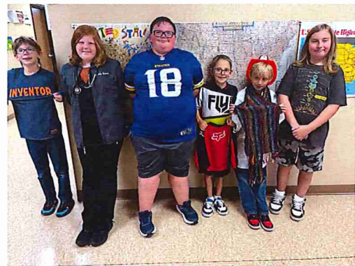
4th grade Bible characters (and the