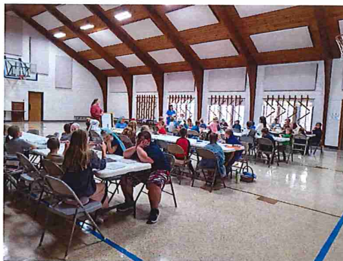
Last week, we played Bible Trivia, drew our theme with chalk, & played kickball with our buddy groups.