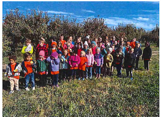
We each got to pick an apple