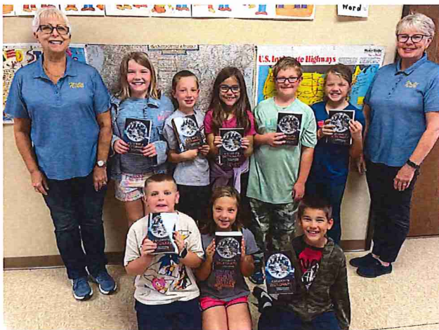
The 3rd graders love their new from

Social Studies: We will continue learning about our country's geography and study the physical features such as land, water, climate and plant life.