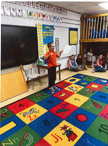
A few pics from Forensics Night

Social Studies: We will learn about communities through time and how we can learn about the history of them.