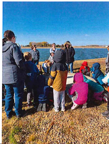
Learning about wastewater treatment!