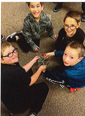
Building during inside recess Math

Social Studies —We will learn about the first communities in our country.