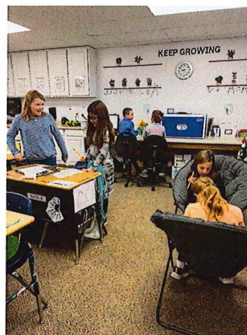
Playing probability games for