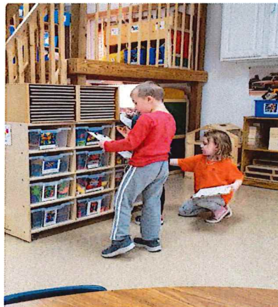
Working together in the block area and finding letters during small group.

If you have not sent in your child's gift for the gift exchange, please do so as soon as possible. Keep reading and record the books you have read on the orange calendar. January's calendar will come home at the end of the week. We will be meeting on Sunday in the Fireside Room at 8:30. Please dress your child in church clothes. They will be sitting with me up in front during the service. You can get your child from the Gym at the end of the service. I hope you have a blessed Christmas celebration!