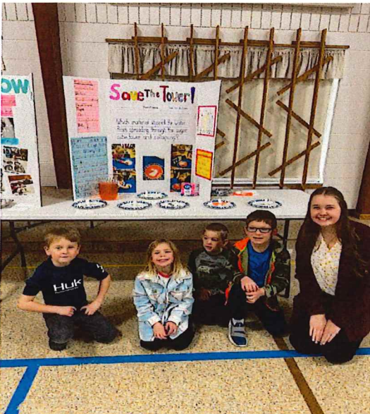
Science Fair Entries

Do you know of someone who might be interested in Kindergarten at Trinity next year? Let me know and I can give you an invitation for our Round Up, February 4, at 6:00 PM.