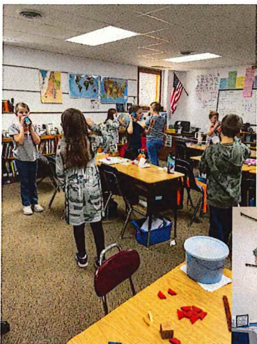
Exploring sound vibrations using paper cup telephones.

Social Studies: We will begin learning about the government, citizens and their rights.