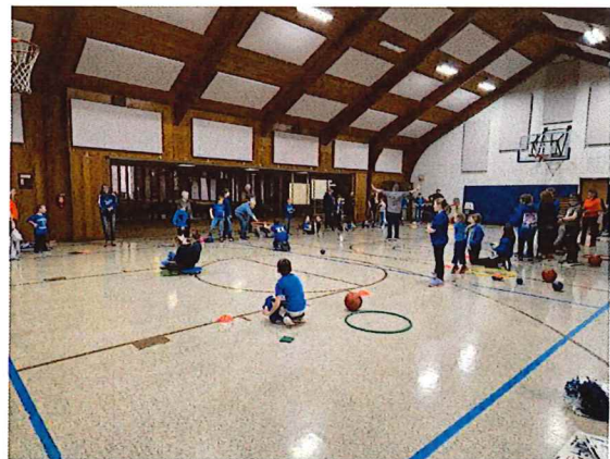
Having fun at our Pep Rally!