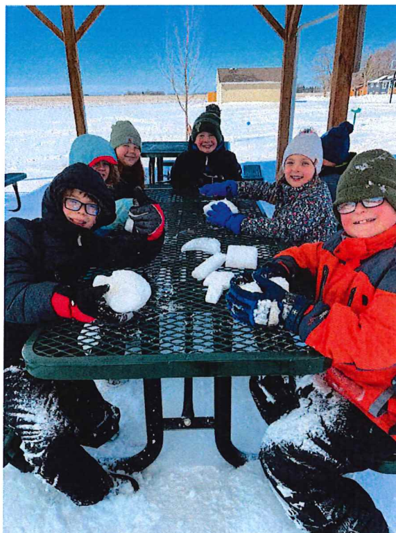
Enjoying the new snow!