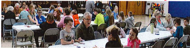
Final 4 th Quarter Reading Buddies

Spending Time with Super Buddies After Chapel