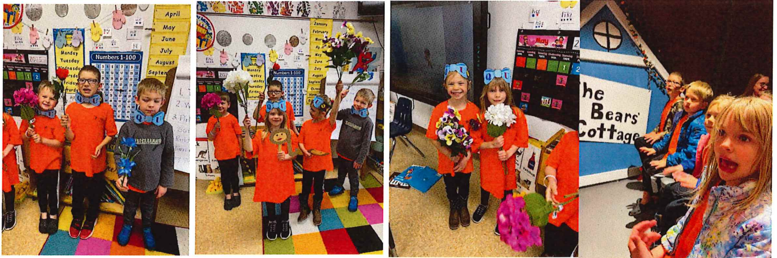
The wedding of Q and u And the Play at MLC

Thursday, May 22nd: Dismissal at 12:00 Noon after a Culver's (optional) Lunch. (A note came home for this and should be turned in today). Closing service at 6:00 PM. The children will sing for this service!